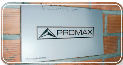
▲ WALL MOUNTING AVAILABLE ▲

CompactMax-2 is a compact transmodulation system that allows to distribute Satellite TV channels (DVB-S or DVB-S2) in Digital Terrestrial Television (ISDB-T/TB) format. It can be connected to up to 4 satellite inputs (2 inputs for free channels and 2 for encrypted ones) to deliver up to 8 ISDB-T/TB muxes with dynamic webserver management via remote control. It is integrated into a 19" 1U Rackmount case. It can also be mounted directly on the wall.